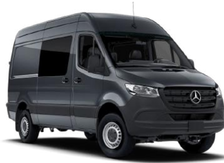
Tenorite Grey Metallic